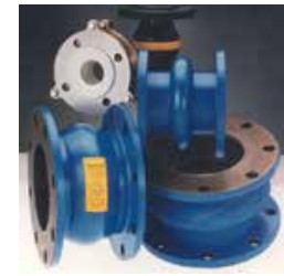
Molded Expansion Joints