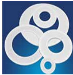
Expanded & Virgin Teflon