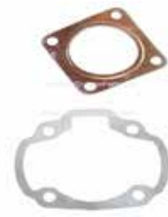
Custom Shape Gaskets