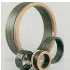
Hydraulic Packing Sets