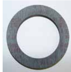
Premium Grade Carbon Fiber