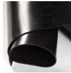
NSF 61 EPDM