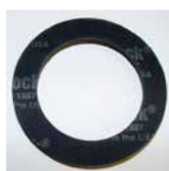
Premium Grade Rubber Sheet