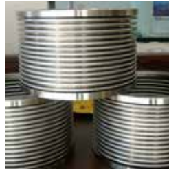
Metal Expansion Joints